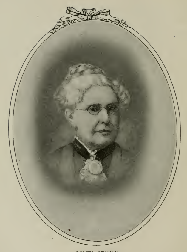
· LUCY STONE