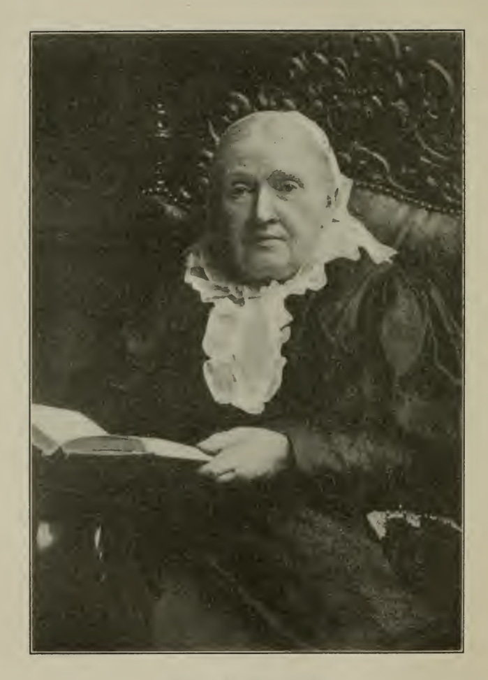
JULIA WARD HOWE