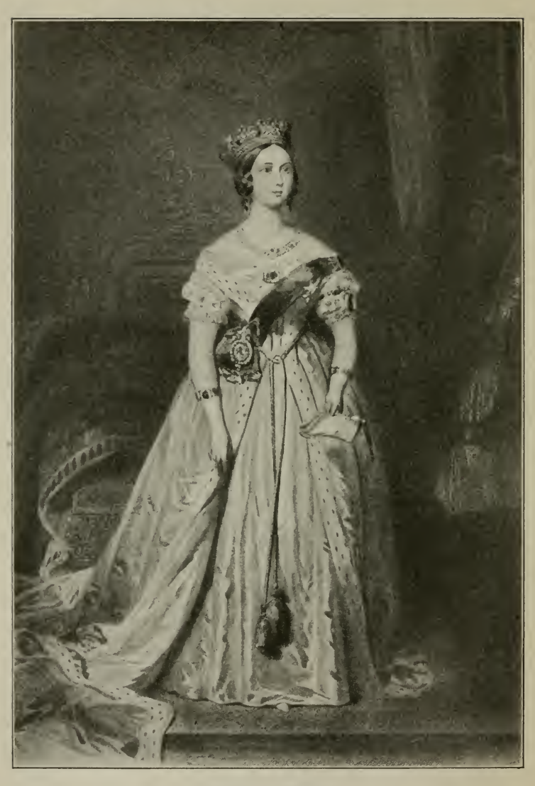
QUEEN VICTORIA From an old engraving