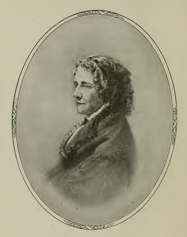
HARRIET BEECHER STOWE